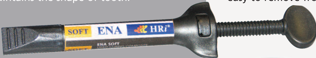
EHTS2 ENA SOFT dentine colour 5 g