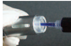
Pic 3. Push the piston towards the bottom of the dispenser using the syringe tip