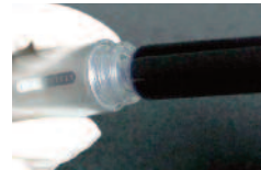
Pic 4. Fill it with the gel...