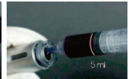
Pic 5. ...until about 5 ml of gel remain into the syringe. Place the syringe with the remaining quantity in the fridge