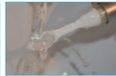
Pic 9. Rinse the toothbrush with running water