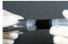
Pic 13. ...towards the bottom of the dispenser