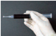
Pic 1. Take the syringe out of the fridge