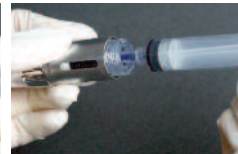
Pic 14. Fill it with the gel until the content of the syringe finishes. Screw the head (see Pic. 6) and give the toothbrush back to the patient.