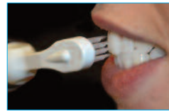
Pic 8. The patient must brush the teeth to be bleached for about 30 seconds with rotating and horizontal movements avoiding as much as possible the contact with gums