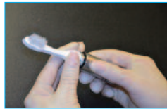
Pic 2. Remove the cap and unscrew the head of the toothbrush from the dispenser