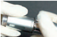
Pic 11. In case further bleaching is needed, the patient must bring the toothbrush to the dentist. Remove the head (see Pic. 2) and rotate the ring towards the direction "DOWN"