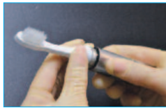
Pic 6. Screw the head of the toothbrush on the dispenser