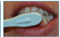
Pic 10. Brush again for other 30 sec. and rinse accurately